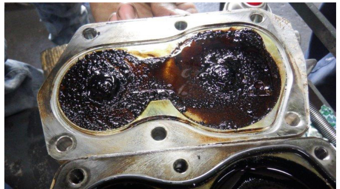
Above: Sludge build up resulting from incompatibility of mixed fluids.

Oil flooded rotary screw compressors utilize many different lubricants with varying types of base stocks and additive packages. Many of these lubricants may not be compatible. Compressor fluids can use mineral or synthetic as base stock, with almost an infinite number of additive packages, which must also be reviewed for compatibility. These base fluids include hydrocarbons of varying qualities, polyalphaolefins (PAO), polyol esters (POE), polyalkylene glycols (PAG), diesters and silicones. These fluids will need proper handling when switching to a new fluid. You can perform a simple compatibility test ( page 2 ) between two fluids before you start your flushing procedure.